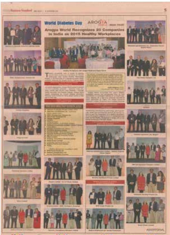
< Healthy Workplace ad in The Business Standard